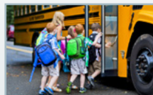
Daycare & Pre-School Childcare Liability