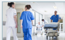
Hospital & Nursing Homes Patient Safety & Privacy Regulations