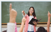
Classrooms, Counseling and Interview Rooms State & Federal Regulations