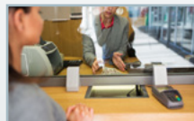
Financial Institutions SIPC/Federal Requirements