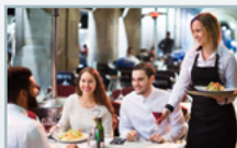
Restaurant & Retail Theft, Public Safety, Slip & Fall Lawsuits